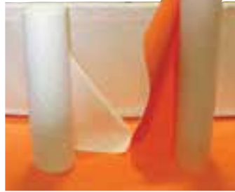
CS1720 (left) and CS1735-FR (right)

facilitates support by any current CA boundary system. It also has a double flap at the bottom edge that allows the curtain to be affixed to the floor inside and outside the contaminated area. Installed height 36-37". The weight of the 300-foot-long roll is only 34 pounds, far